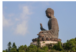
Figure 1: By Béria L. Rodríguez, CC BY-SA 3.0

Most Computer Scientists think " P \neq NP ". If that's true, then there is no correct, deterministic algorithm for any NP-complete problem that runs in polynomial time. 4 Specifically: if a problem is NP-complete, it's hopeless to write an algorithm that scales to arbitrarily large problem sizes and definitely, precisely solves every possible instance of those sizes correctly for exactly that problem.